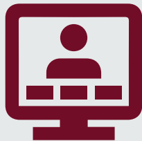
Webinars with vendors